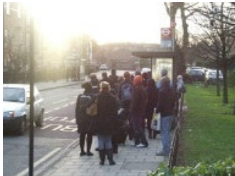
08:09 – queue