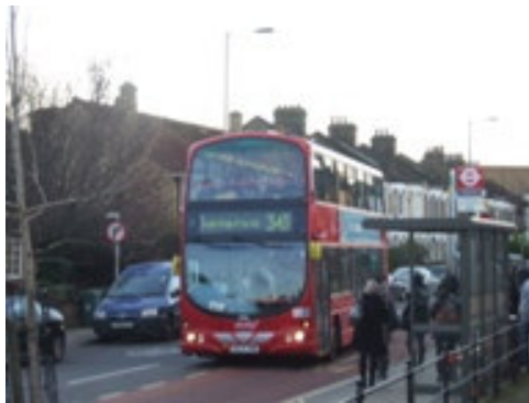
08:09 – bus passes full without stopping

(Estimated load % rounded to the nearest 5%)