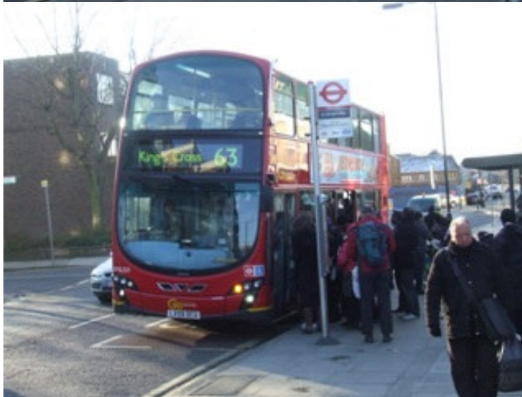
08:55 not everyone is going to get on