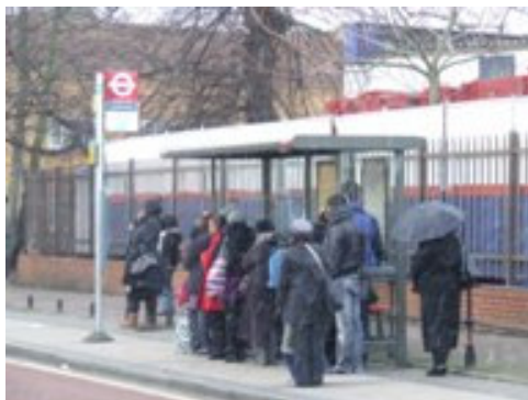
08:50 – queue. People left behind at 08:36 are still waiting