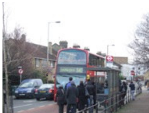
08:52 – first of two buses arrives