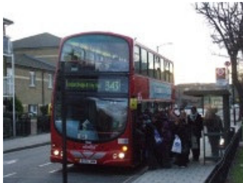
08:01 – more than 20 people board

(Estimated load % rounded to the nearest 25%)