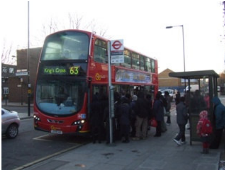
07:52 crowds wanting to board