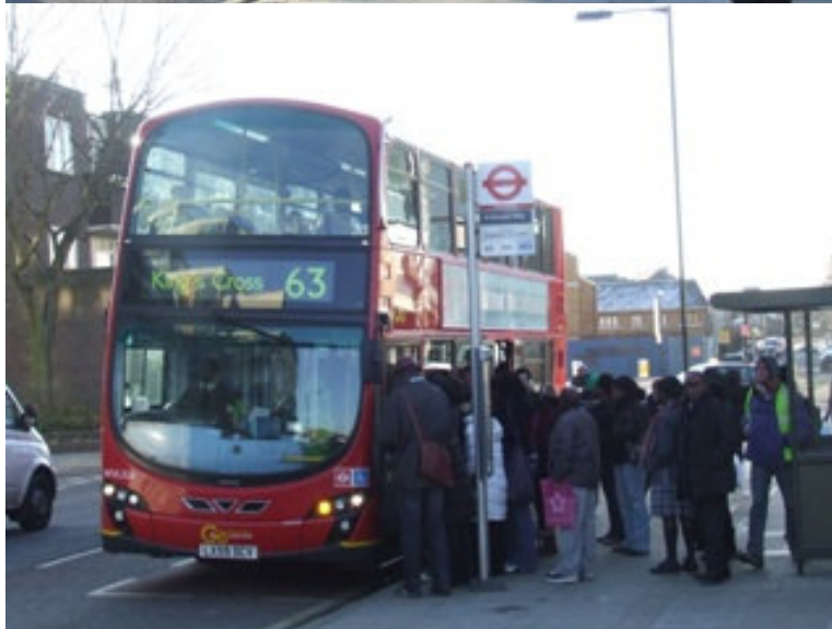
09:17 again, not everyone is going to get on