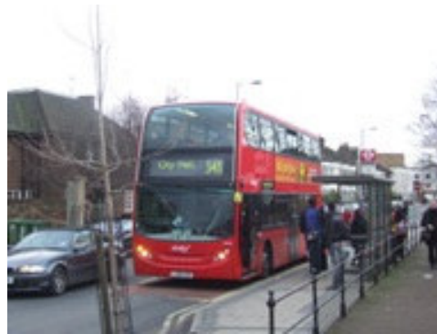
08:36 – bus full, passengers left behind