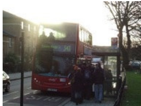
08:10 – 30 people board one bus