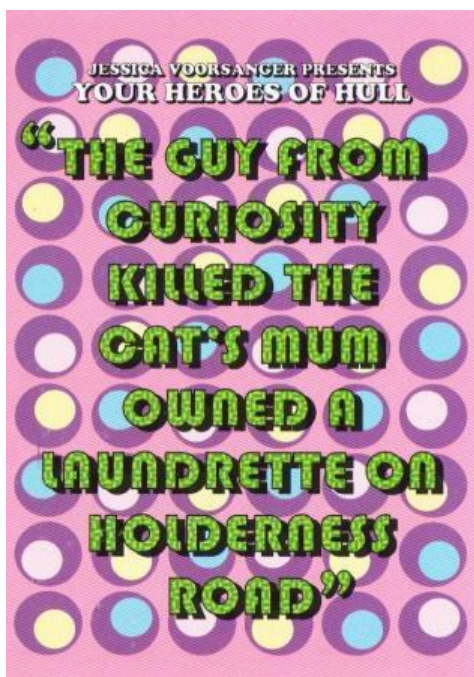
Hull Heroes, Hull Time Based Arts, Illuminate (selected poster details), 2006