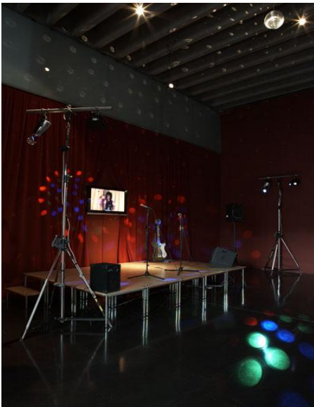
(Detail), Stage with plasma screen