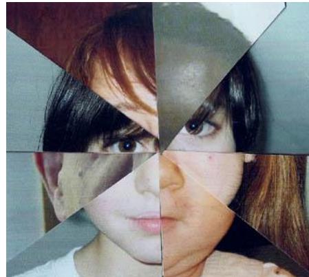
Pinwheel Portrait example