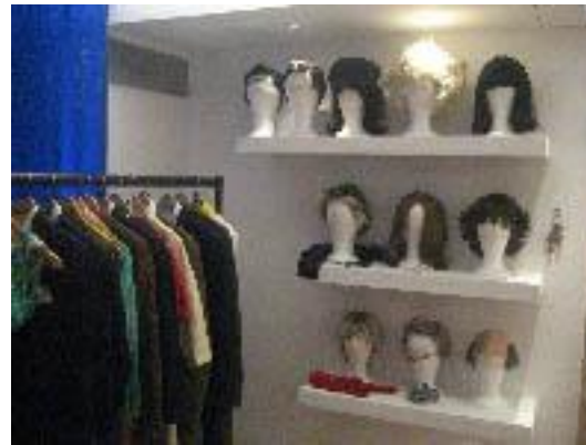
(Detail) Wigs & Accessories