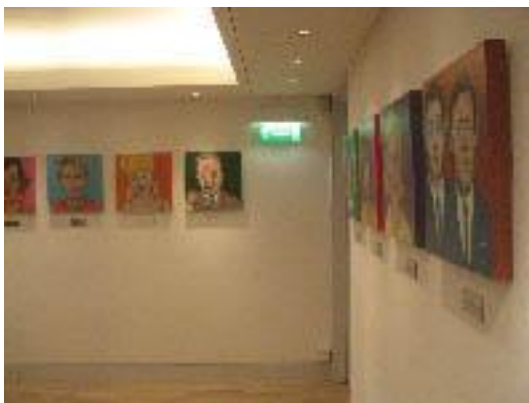
(Detail) Entrance, Portraits