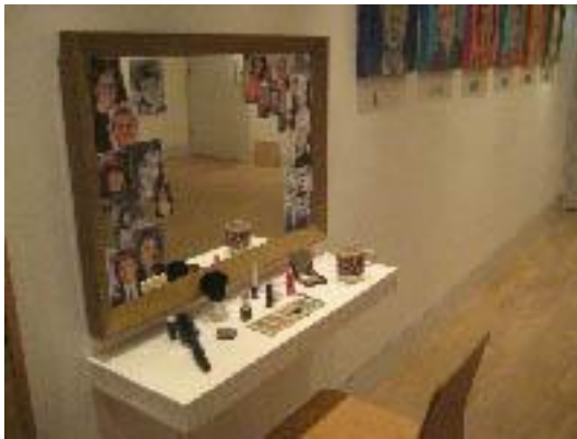
(Detail) Make-up area