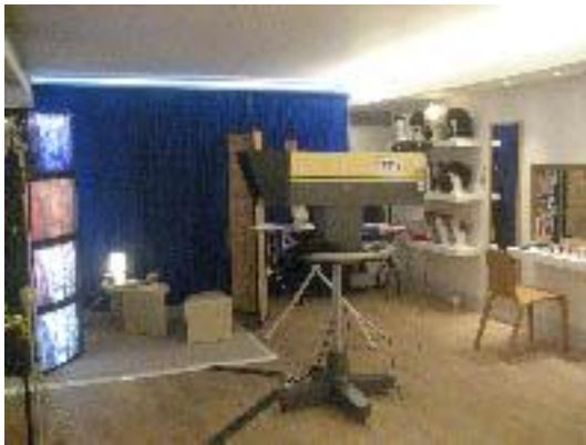
(Detail) Studio View