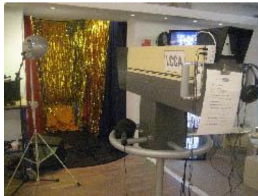
(Detail) Camera View