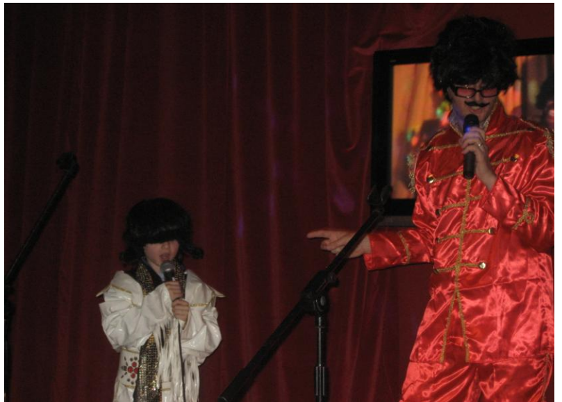
(Detail), Participants as Elvis & George Harrison