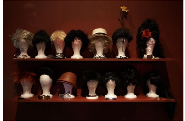
(Detail), Wigs & Accessories