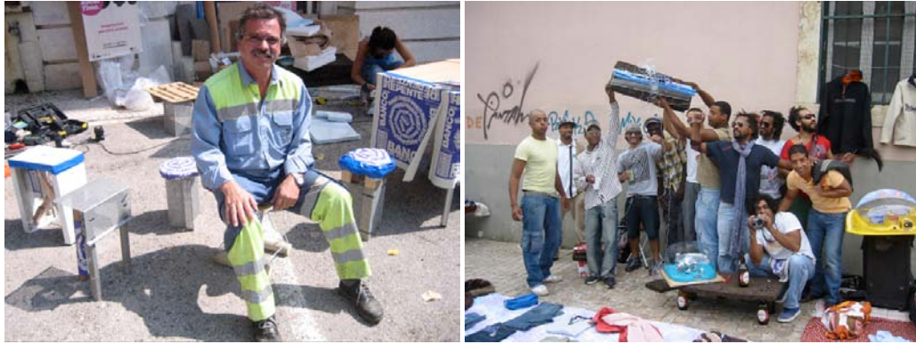
Street workshop to produce stools and benches for public use from found local material.