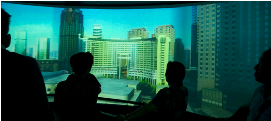
Shanghai Planning Museum 2005

In London, social change, economic shifts and wars have mandated a continual process of architectural reinvention. Attempts to improve upon the assumptions and solutions of previous generations have resulted in an unending process of repair, modification, demolition and rebuilding of the homes that are symbolic of our aspiration for a more fulfilled life. While indoor plumbing, privacy, access to gardens, shared space and higher quality structures have resulted from some of these changes, with each new solution there are structures, which are rendered redundant; experiences, which become inaccessible and memories, which become fantasies. I am interested in the relationship between navigable, virtual and amenity space.